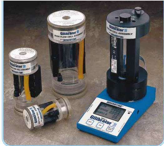
The GILIBRATOR-2® Base can be used with any of three wet cells (left) or the Sensidyne unique new soapless piston cell (shown mounted on base).