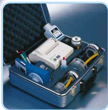
Deluxe Wet Cell Kit with printer