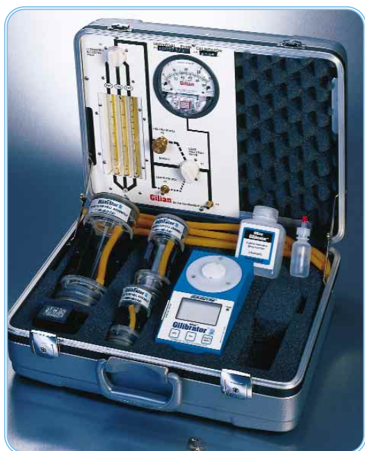
Deluxe Wet Cell Diagnostic Kit