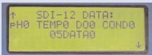
Display window showing SDI-12 connection status.

The 6712 functions as a SDI-12 logger and connects to any sensor that fully implements the protocol standard.